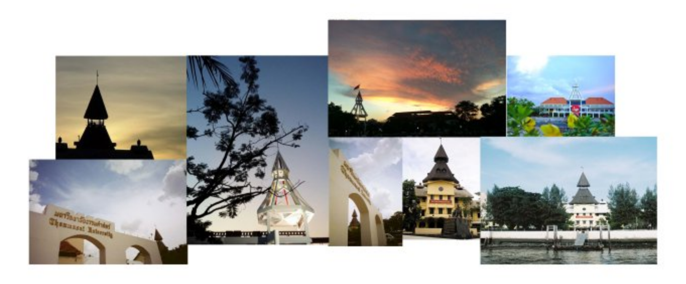
Master of Arts in Asia-Pacific Studies, Thammasat University